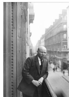
① Albert Kahn