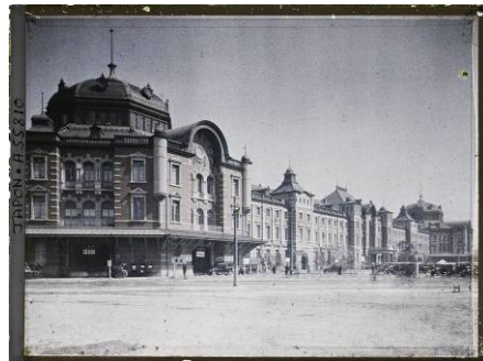
⑩ Japan, 1926