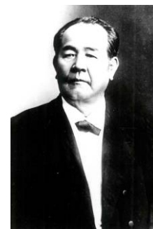
② Eiichi Shibusawa