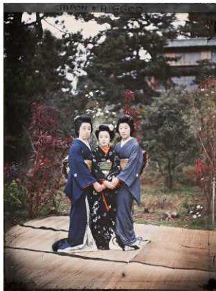
⑨ Japan, 1912