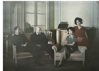
③ Albert Kahn with the Prince Kitashirakawa and Princess Fusako at his villa, 1923

Albert Kahn was born in 1860 in Alsace, France. After working his way through higher education in Paris, he made a huge success as a banker. Convinced that peace is built on a foundation of mutual understanding among people of the world, he devoted his wealth to the projects such as the “Overseas Travel Foundation” to send young scholars of various countries to abroad and the “Archives of the Planet” to dispatch photographers to record the people and customs of about 60 countries. Kahn also traveled to many different parts of the world himself. He was especially attracted to Japan and visited there in 1896, 1897 and 1908. He had contacts with major businessmen and politicians including Eiichi Shibusawa and Shigenobu Okuma, and imperial family members such as Princes Kitashirakawa and Asaka.