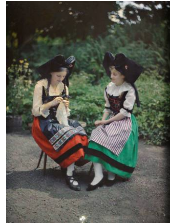
⑧ France, 1918