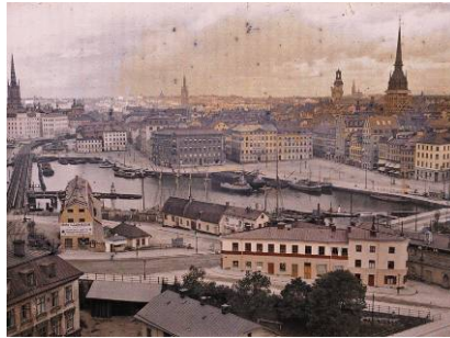
⑦ Sweden, 1910