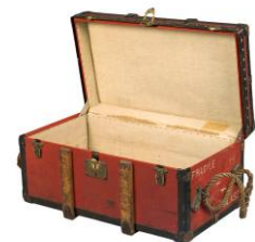
⑤ Trunk for camera made by Louis Vuitton (1929)