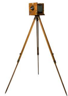
④ Camera used for the Archives of the Planet (1910)

Kahn’s photographers visited Japan for three times. In 1908, a photographer joined Kahn’s second trip to Japan and took more than 500 black and white stereophotohs. The photographer’s travel diary gives us clues to identify the photo sites and to know what Kahn saw and experienced during his stay. The exhibition also includes the autochrome photos taken by two other photographers in 1912 and 1926-1927 respectively. All these photos are valuable records of Tokyo, Kyoto, Nara and many other places in Japan in early 20th century.