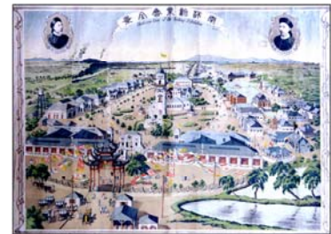
Nanking Government Exhibition round in 1909 (Nantong Museum)