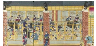
Spinning Silk Thread on Imported Wheels with Clockwork in Tsukiji, Tokyo (Shibusawa Memorial Museum)