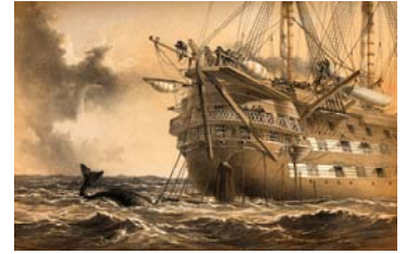
"Laying the Atlantic Cable"