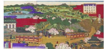
Steam Locomotive Running Between Ueno and Kumagaya (Shibusawa Memorial Museum)