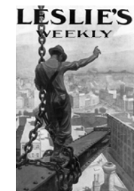
"Ironworkers Dizzy Ride," published in Frank Leslie's Illustrated Newspaper