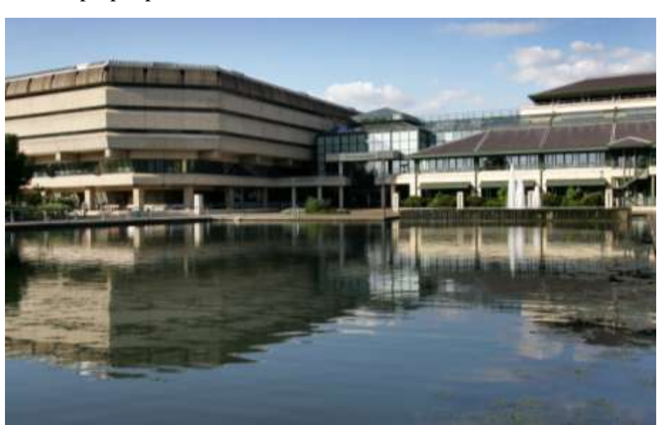
Image 1 – Exterior of The National Archives

promote the use of business collections, and to raise standards in the care of corporate archives by promoting best practice, principally through the Managing Business Archives website.