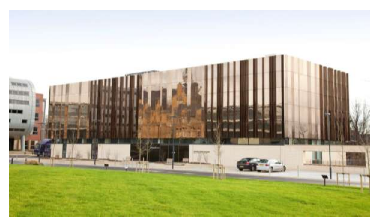
Image 2 – The Michael Marks Building, new home of the M&S Company Archive.