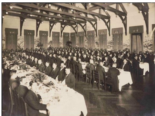
2) Tōkyō Teishin Kanri-kyoku (Tokyo Communications Bureau) Members Appreciation Banquet (at the Imperial Hotel, 1912)