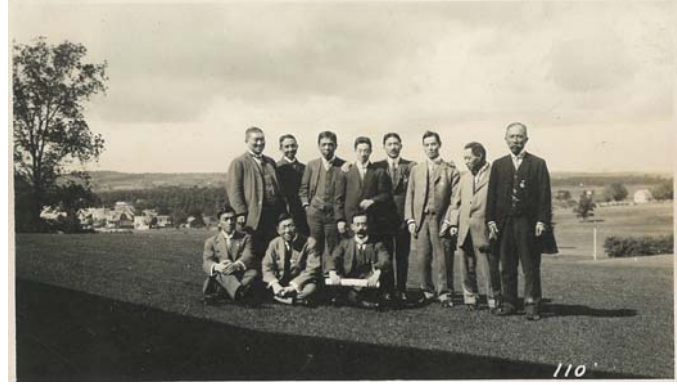
4. Members of the Honorary Commercial Commissioners of Japan, Shibusawa Memorial Museum Collection