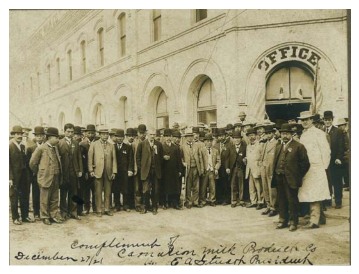
2. Condensed milk factory in Seatle