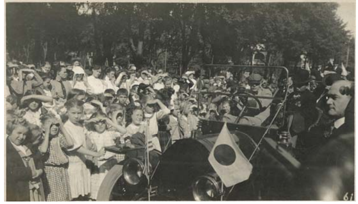
3. Welcoming ceremony at Grand Forks