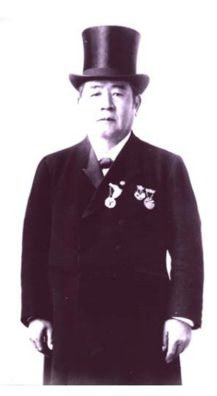
1. Shibuawa Eiichi in the U.S.A., Shibusawa Memorial Museum Collection

The images below are available for press use. Please fill in the attached application form and fax it to the Shibusawa Memorial Museum.