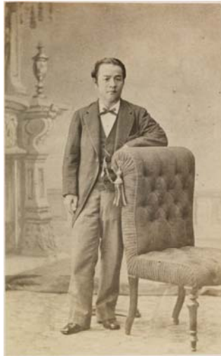
① Shibusawa Eiichi (1883)