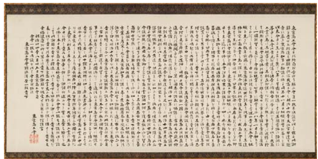
④ Words of Thanks from the Tokyo Commerce and Industry Society (1891)