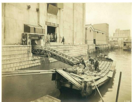
Unloading commodities by conveyer belt at the Kayaba-cho riverside warehouse, Shibusawa Warehouse Co., Ltd., 1929