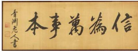
Calligraphy by Shibusawa Eiichi “Think of trust as the foundation of all things” From the collections of the Shibusawa Warehouse Co., Ltd

The exhibition aims to shine a light on the essential role of warehouses and logistics in the development of economy and industry by exploring the role of Shibusawa Eiichi in Japan’s logistics industry as seen through his relationship with the Shibusawa Warehouse Co., Ltd.