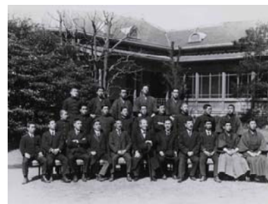
Photo: The Second Group of Graduates of Kaigai Shokumin Gakkou (Overseas Emigrants School) with Shibusawa Eiichi (front row center), March, 1920.

The exhibition explains how Shibusawa Eiichi, a leader in Japanese business society at the time, felt about the overseas emigration and businesses concerning Japanese immigration to Brazil, and how he involved himself in related activities. We hope that through a close look at his business involvements, you will learn about one aspect of the history of Japanese immigration to Brazil.